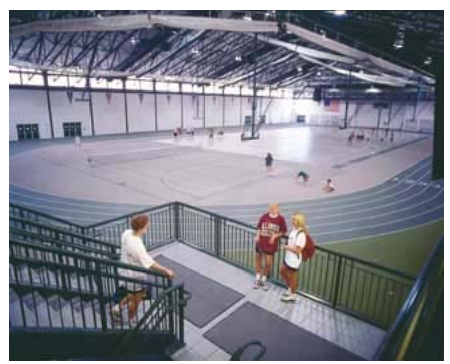
View of the Indoor Track from Second level of Shirk Center